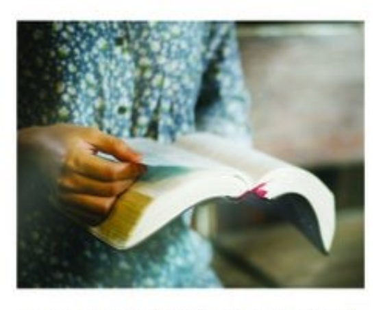
Excerpts from the Lectionary for Mass ©2001, 1998, 1970 CCD. The English translation of Psalm Responses from Lectionary for Mass © 1969, 1981, 1997, International Commission on English in the Litungy Corporation. All rights reserved.

Acts 14:21-27/Ps 145:8-9, 10-11, 12-13 (see 1)/Rv 21:1-5a/Jn 13:31-33a, 34-35